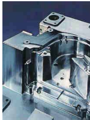
This mold is made possible by Fineline® process, an advanced technique for sulfur removal.