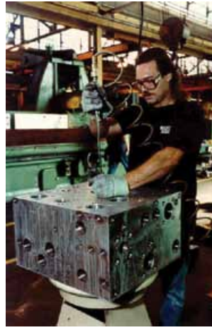
MTD 1 and MTD 2 are available with Clean-Cut processing for improved machinability.

* Some tool steels may be melted at outside facilities.