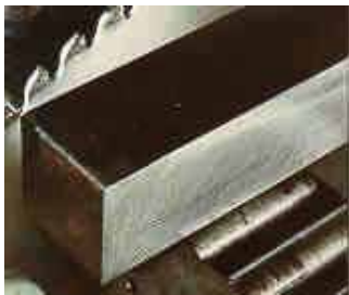
ArcelorMittal USA MTD plates are routinely saw cut into bar stock and mold base plates.