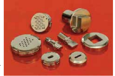
Die shoe, holder block and punches.