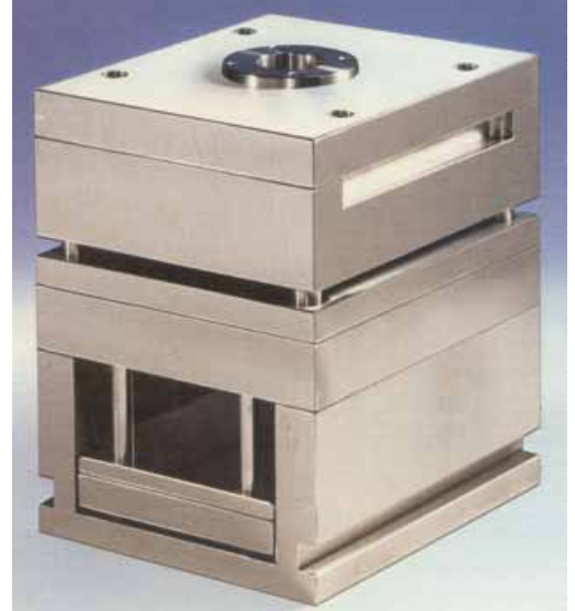
MTD steels comprise most of the components of this mold base.