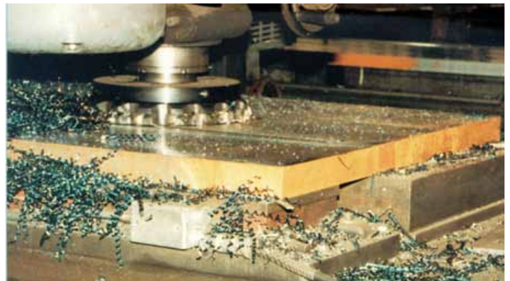
ArcelorMittal USA Tool Steels are also available as Finishline ™ , a pre-finished plate product with decarb-free top and bottom surfaces.

* Brinell hardness (HB) readings are taken from standard test locations on the plate surface after the decarburization layer is removed. This range of HB converts to 27-34 Rockwell "C". ArcelorMittal USA uses HB measurement as its official test. ** Check with ArcelorMittal USA plate offices for the availability of other grades.